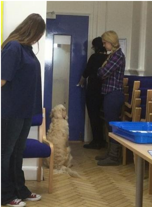
Wait – Adult/child must enter/exit room first